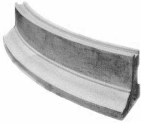
(797) Dam Arcara Segment