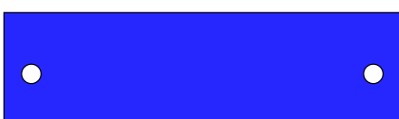
20mmx200mmx5mm Flat bar to brace segments together